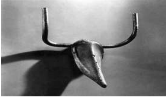
The Bull's Head

ISSN (ONLINE): 2395-0897 / ISSN (PRINT): 2454-2296 October to December, 2018