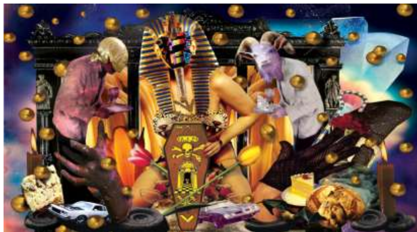
Kaleidoscopic Collage, this artwork will be able to bring closure to the design and creative art, (Tanja M. Laden 2)

devised, and shaped in prototyped (Christensen, Poul Rind, and Sabine Junginger 4) structure.” Lorenz (1990) also accentuates the budding central role of ‘design’ from a strategic perspective. According to him (1990), “the old weapons for achieving real demarcation have become inadequate. No longer can comparative advantage be sustained for long through lower costs, or higher technologies. The design facet is no longer an optional part of marketing and corporate strategy, but has to be at their very core.”